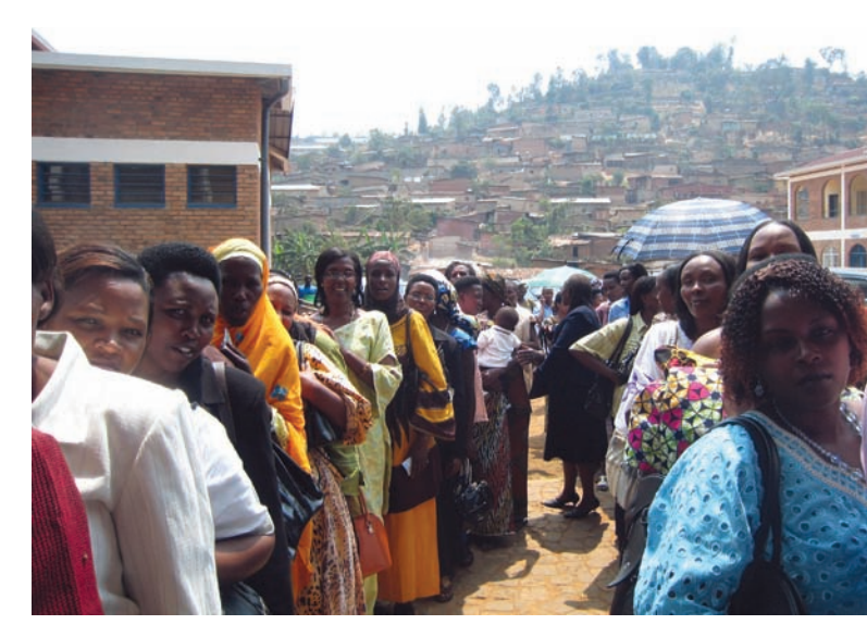
ARwandan women queue to cast their votes.

In addition to the single and lower houses, several upper houses reached or surpassed the 30 percent target in 2008. Swaziland's upper house saw the election and appointment of 40 percent women members to the chamber, its highest proportion ever. In addition, renewals in Belarus (33.9%), Belize (38.5%), Grenada (30.8) and Spain (29.9%) resulted in a critical mass of women in each chamber. This brings to 15 the number of upper houses to have reached the target in 2008.