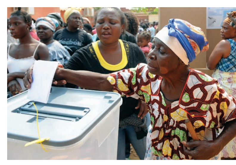
🔺 Woman voting, Angola.

Asia has registered the slowest rate of progress in terms of women's access to parliaments over the past fifteen years, reaching a regional average of 17.8 percent. There were some significant gains for women in 2008, however. In all, 14 chambers were renewed and women took nearly 19 percent of the seats on offer. The biggest gain was registered